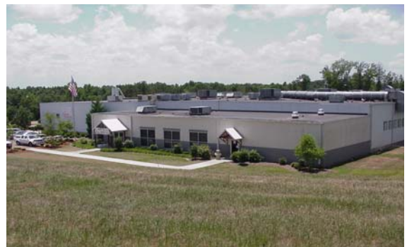
Tyson Foods state-of-the-art hatchery is the only current occupant in the park.